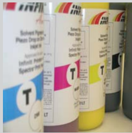
INFINITI TINU INK CMYK