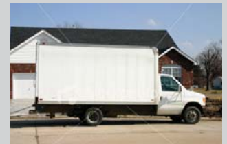
INDOORS - OUTDOORS APPLICATION