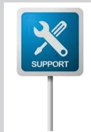
TECHNICAL SUPPORT 24 / 7